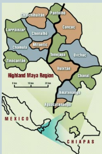
FIGURE 1 Map of the highland region in Chiapas, Mexico—an area characterized by a polarized political climate.

last few decades, poverty, population pressure, environmental degradation, and political conflict have intensified in Chiapas. Widespread political unrest and violence continue despite a "cease-fire" between the Mexican government and supporters of the Zapatista movement that first appeared in 1994. Despite these odds, projects aiming to support traditional indigenous health care while exploring ways of conserving local biodiversity are being continued in Highland Chiapas.