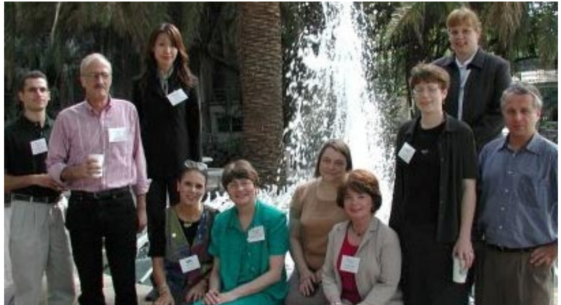
Participants of SEALLT 2003

SEALLT 2003, Sharing Successful Teaching Materials and Technologies, was held on February 28 and March 1, 2003 at the University of Miami in Coral Gables, Florida.