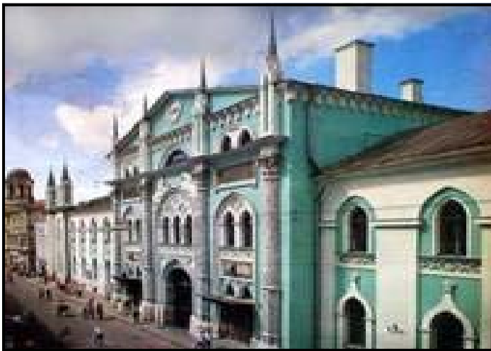
Russian State University for the Humanities

Students live in rooms for two persons in the Russian State University for the Humanities dormitory. Meals are available in cafeterias and restaurants near the campus.