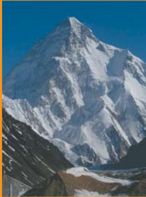
The hydraulic reserves stored in the mountain ranges of the Hindukush-Karakoram-Himalaya represent water towers of mankind and are the most extensive glaciated area outside the polar regions.